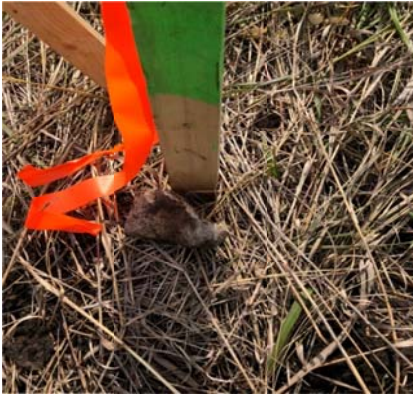
Sept 11/18 SSKP 1057 bone find