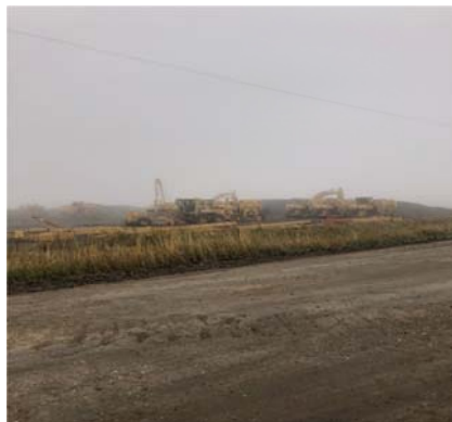
Sept 15/18 photo of earth moving machines looking North