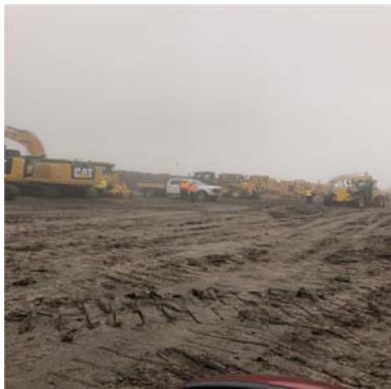
Sept 15/18 SSKP 1000 Photos of personal waiting out the thick fog and cloud