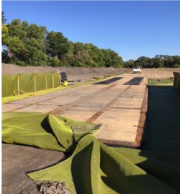
Sept 10/18 Dead horse creek wash station