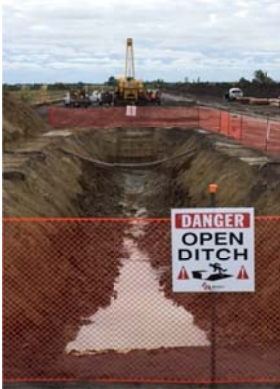
Sept 12/18 ROAD BORE PIT at SF 35