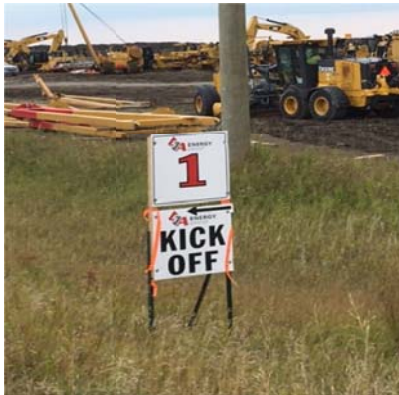
Sept 14/18 Kick off