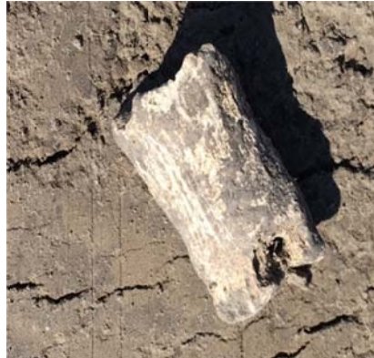
Sept 10/19 Bone found at 1057