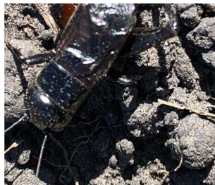
sept 10/18 Photo of a crickets