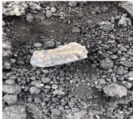
Sept 12/18 Photo of bone SSKP 1057.850