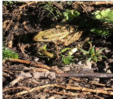
Spet 10/18 photo leopard frog in SSKP 1057