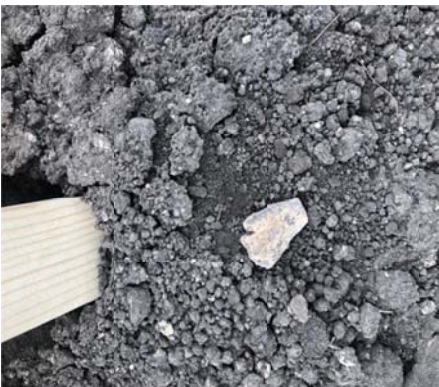
Sept 12/18 Photo of bone SSKP 1057.850