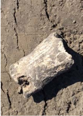
Sept 11/18 AT SSKP 1057