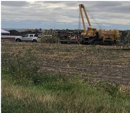
Sept 12/18 pics of crew laying pipe close to find