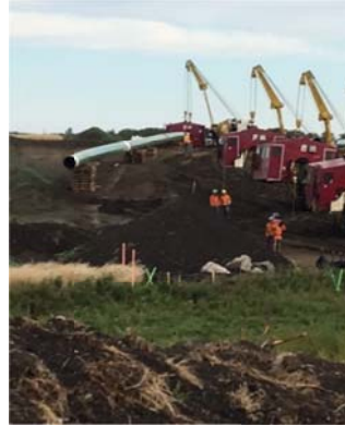
Sept 14/18 Welding shacks at kick off