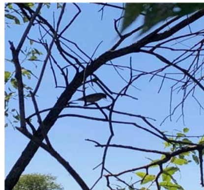
Sept 10/18 Photos of small song bird