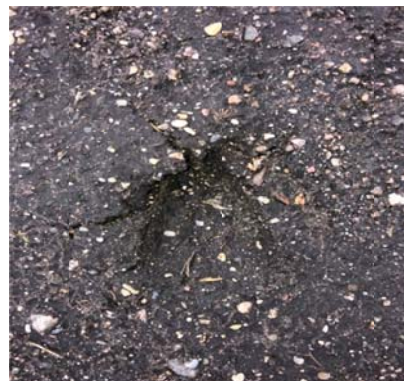
Sept 13/18 Deer tracks looking wesy SSKP 1039