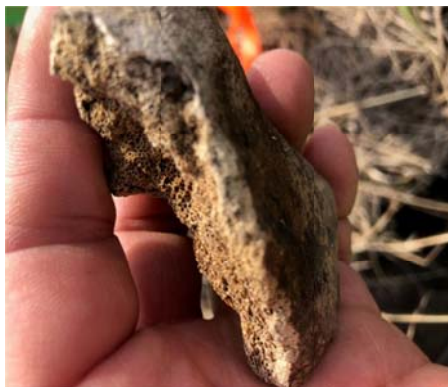
Sept 11/18 SSKP 1057 bone find