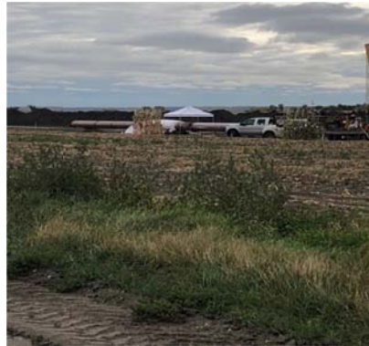
Sept 12/18 Construction crew laying pipe close to Shoe Fly 35 where bone found