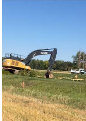
Sept 11/18 SWEPT SSKP 1041 putting the bridge