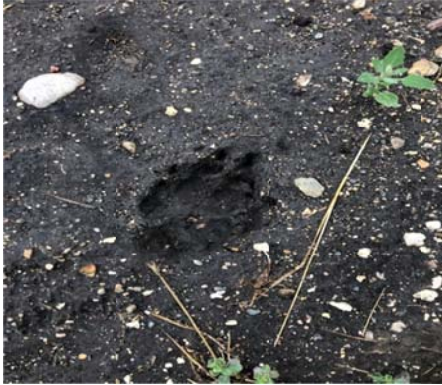
Sept 13/18 photo coyote track looking west SSKP 1039