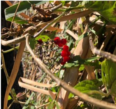
Sept 10/18 photo of medicine in SSKP 1057