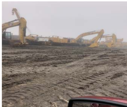
Sept 15/18 Photo of machines at stand still fog rain