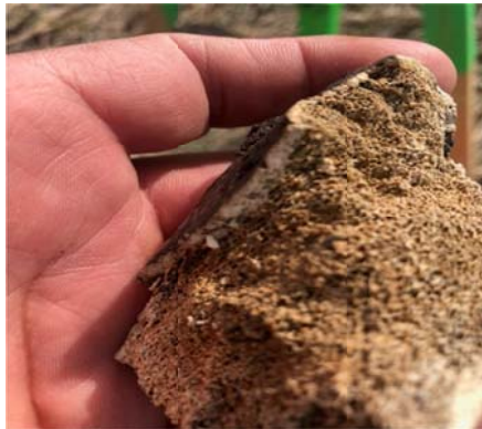
Sept 11/18 SSKP 1057 bone find