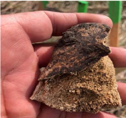
Sept 11/18 SSKP 1057 bone find